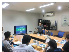
• Product training for customers