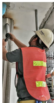
• On site Technical Service