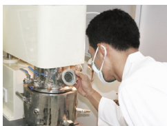
• Innovation of product