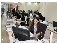
• Customer Care Service that our competitors and business associates speak about.